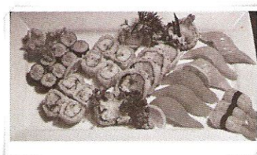
Bluefin Tray A